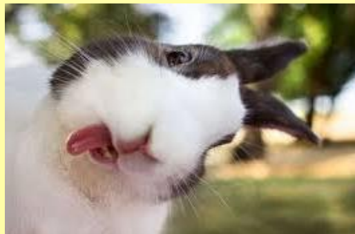
Weird Bunny Facts

"What, you thought I could only multiply?"