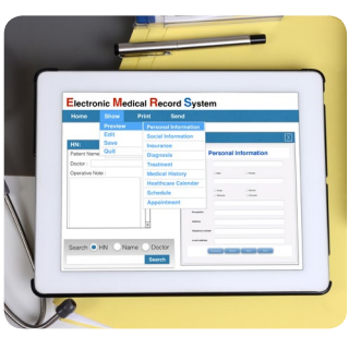
Having your medical records in one place