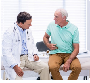
Asking questions and getting answers